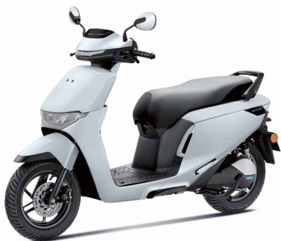
Pearl Misty White

*Products shown in the pictures may vary from actual products available in the market. All features and colours may not be part of all variants. Accessories shown in the pictures are not part of standard equipment. For creative visualisation only.